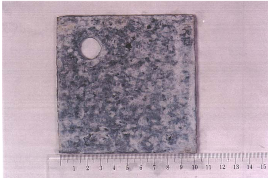
Picture 4 The surface appearance of the sample with serial number 8 after the 1000 hours salt spray test.